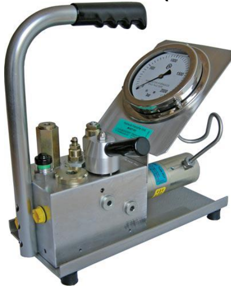
miniBOOSTER M- HC7